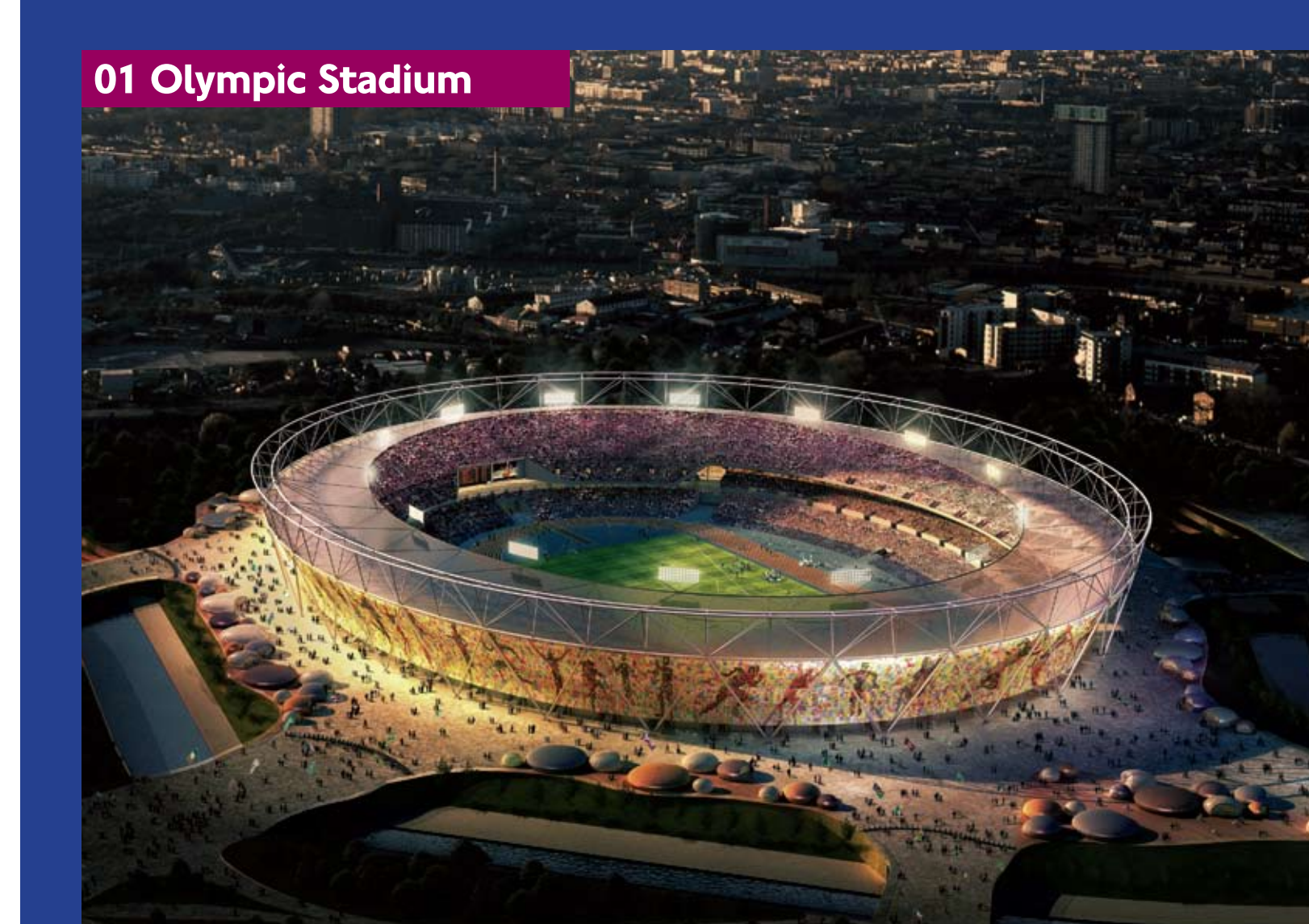
01 Olympic Stadium

Walkway between West Ham and Olympic Park