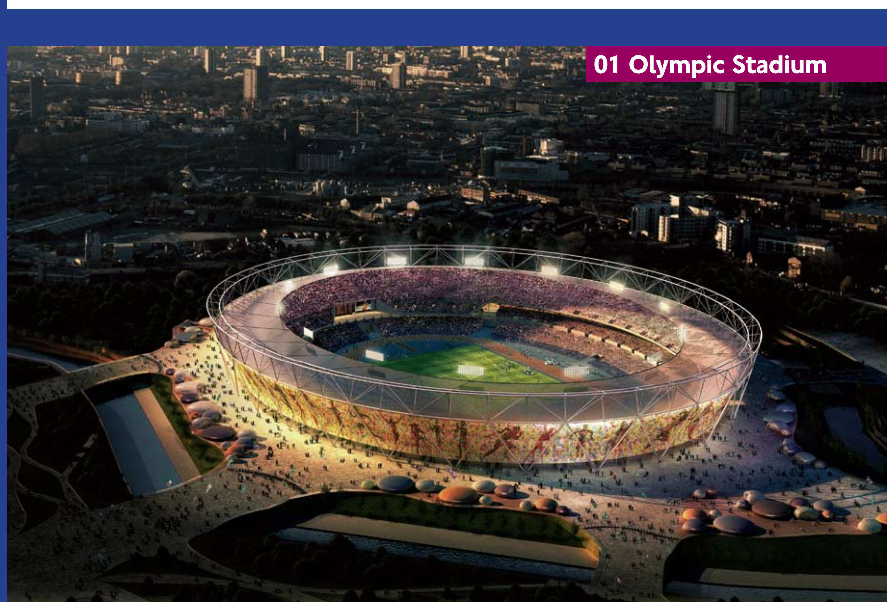
01 Olympic Stadium